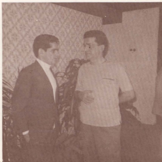
Sérgio Bittencourt e Jacob do Bandolim (1968)